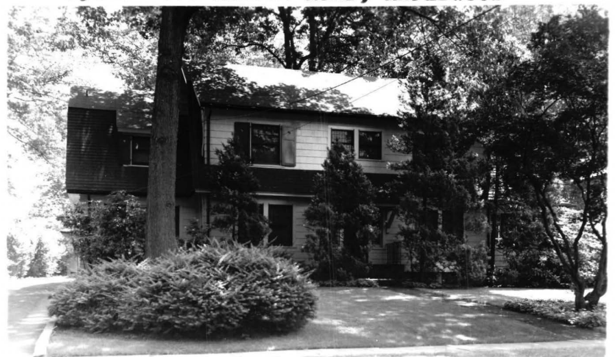
Board of Realtors of the Oranges and Maplewood Photo by George B. Biggs. Inc.